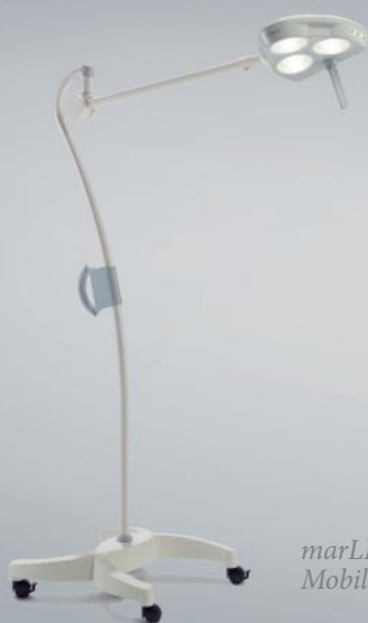
marLED® E3 Mobile version