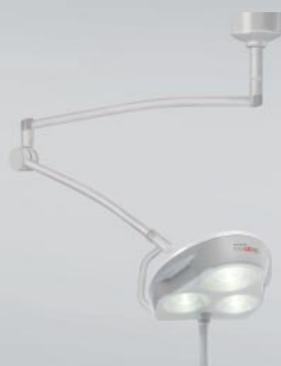
marLED® E3 Ceiling-mounting version