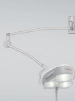
marLED® E3 Wall-mounting version