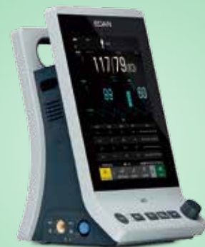
iM3 Vital Signs Monitor