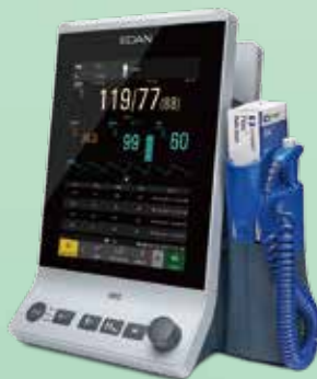
Covidien Quick TEMP