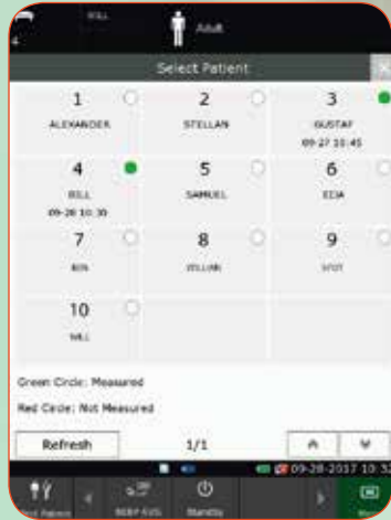
Patient status with color code