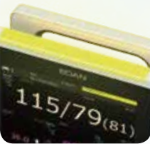
360° Alarm Light