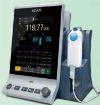
Infrared Ear TEMP