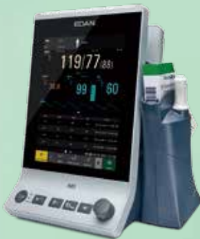
EDAN Quick TEMP