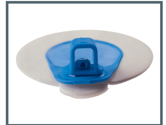
A = 4 mm fitting