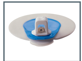
F = 3 mm fitting