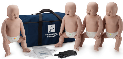
ITEM #PP-IM-400M-MS (with CPR Monitor) ITEM # PP-IM-400-MS (without CPR Monitor) (Prestan Professional Infant Manikin 4-Pack)