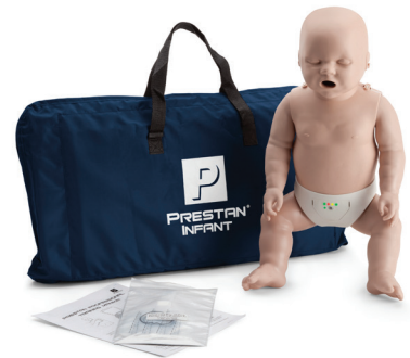
ITEM # PP-IM-100M-MS (with CPR Monitor) ITEM # PP-IM-100-MS (without CPR Monitor) (Prestan Professional Infant Manikin Single)