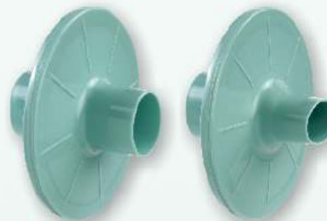
PBF-100 Patient side connection ISO-30 medical taper, Male